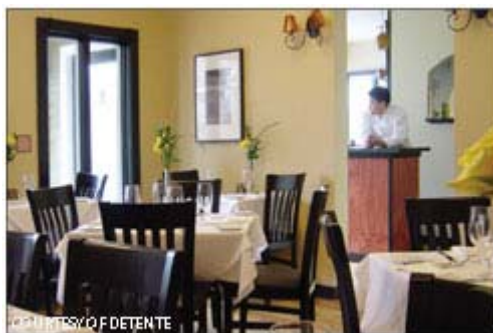
Edgartown's D tente focuses upon contemporary cuisine.