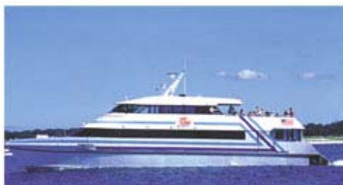
Hy-Line's Lady Martha now zips year-round from Hyannis to Oak Bluffs in 55 minutes.

Exciting news from Hy-Line Cruises (800-492-8082): High-speed ferry service between the Ocean Street Docks in Hyannis and Oak Bluffs Harbor on Martha's Vineyard has begun and will be available year-round! Five daily trips are scheduled for and from each port, conveniently slated for