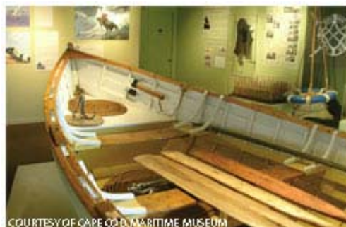
In the workshop of Cape Cod Maritime Museum, a replica of the 1886 Catboat is under construction.

The John F. Kennedy Hyannis Museum has reopened at the Old Town Hall on Main Street, having been closed for renovations that took almost a year to complete. The museum has been painted, carpeted, and made handicapped accessible via a wheelchair ramp and elevator. Fifteen new photographs from the family's collection have been added, and a new alarm system will allow artifacts from the Kennedy Library in Dorchester to be loaned to the local museum. The old Trayser Museum, which had been deteriorating for years, was finally vacated in 2004 by the Barnstable Historical Society. After a great deal of loving labor and renovation, the old building has reopened as The Coast Guard Heritage Museum (3353 Route 6A, Barnstable Village). Here you will find a rich collection of artifacts that celebrate not only the Coast Guard but also its predecessors, the U.S. Lifesaving Service and the famed volunteer surfmen who saved shipwreck victims. Additional items on display include ship models, artwork, medals and a video presentation. Open from 10 a.m. until 3 p.m. on Fridays and Saturdays. Adult admission is $5; children are free.