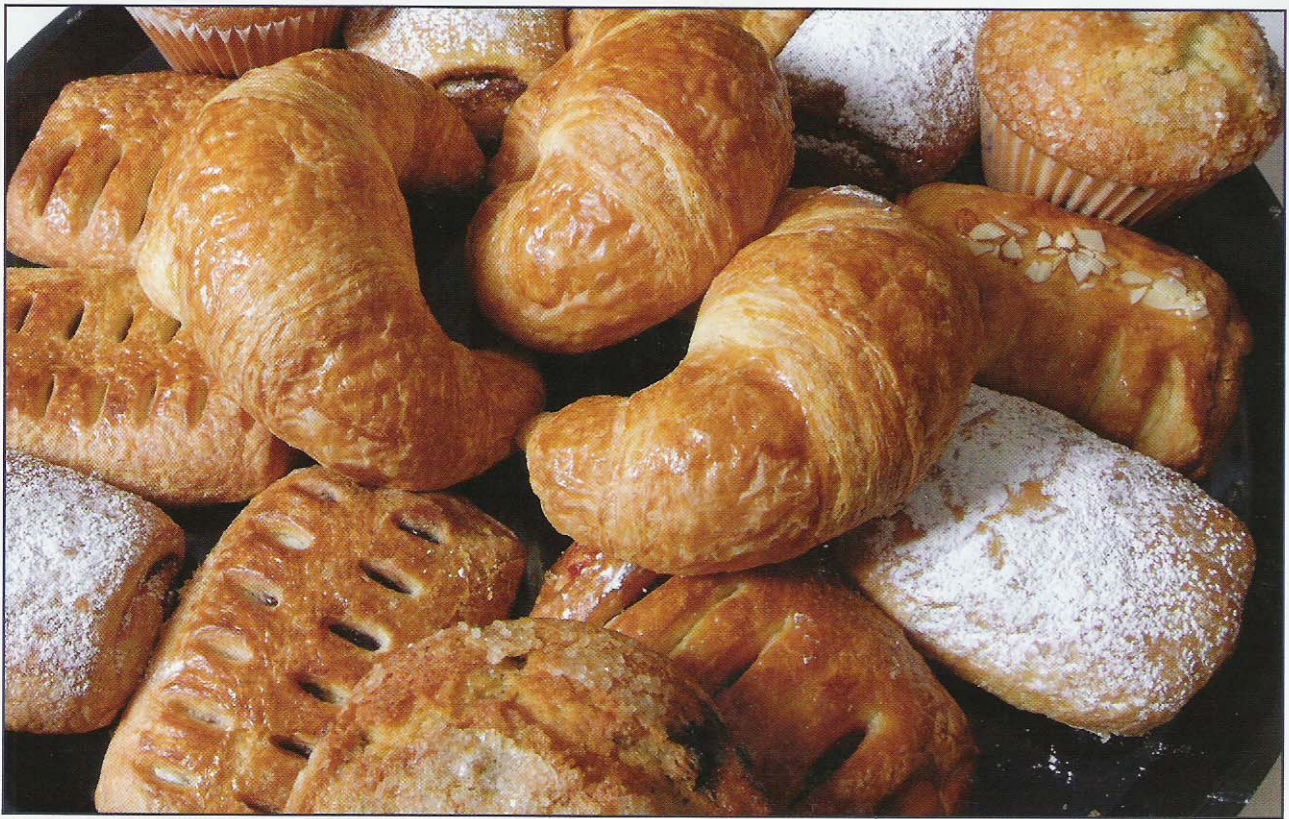
At La Petite France, plain and filled croissants are popular at breakfast and throughout the day.